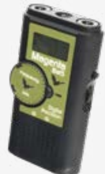
Magenta Bat 5 Bat Detector