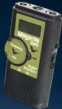
Magenta Bat 5 Bat Detector