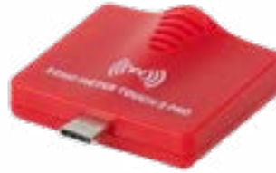
Echo Meter Touch 2 Pro #255962

For consultants or bat workers, the Touch 2 Pro has some advanced settings such as adjustable gain settings and sample rates.