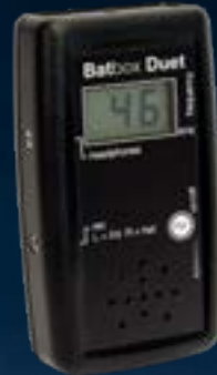
Batbox Duet Bat Detector