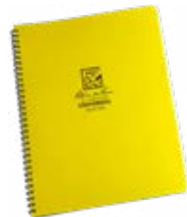
Rite in the Rain Side Spiral Notebook (Maxi) #207764