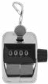
Hand-Held Tally Counter #183511

NHBS In the Field: Pettersson U-series USB Ultrasonic Microphone