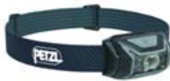
Petzl Actik Headtorch #262215