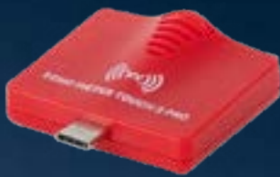
Echo Meter Touch 2 Pro