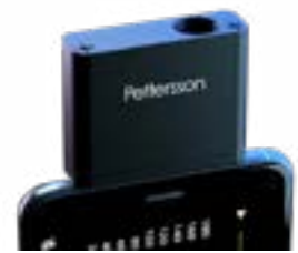
Pettersson U-series USB Ultrasonic Microphone #248984

For iOS users, the Pettersson U-series USB Ultrasonic Microphone functions in a similar way to the Echo Meter and will work on both iOS and Android devices but does not have the auto classifier functions of the Echo Meter.