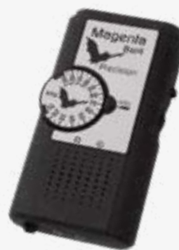
Magenta Bat 4 Bat Detector

The main drawback with a heterodyne detector is that it is only possible to listen to one frequency at a time, so it is possible to miss species if they pass calling at a frequency the detector is not tuned to. Heterodyne signals are also not used for analysis software and are often used for listening purposes only.