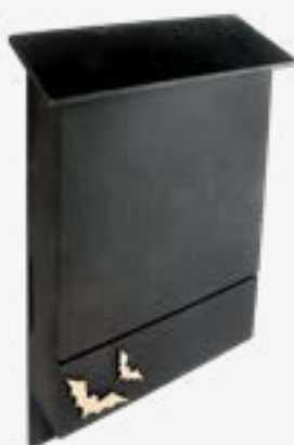
Causa Maternity Bat Box