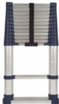
Xtend & Climb Pro Telescopic Ladder