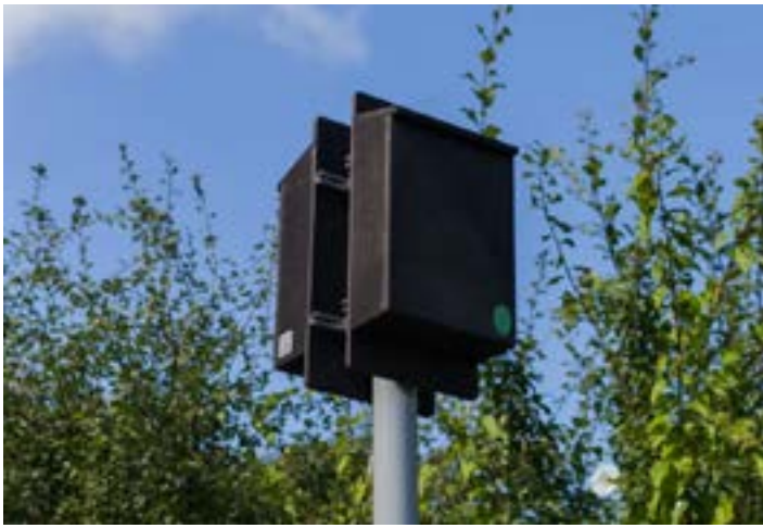
Habitat Bat Box 001

There are also pole-mounted bat boxes (sometimes known as rocket boxes). These bat boxes are helpful alternatives in areas where there is nowhere to mount the bat box. An additional benefit is that they ensure that the box is exposed to as much sunlight as possible in shaded areas.