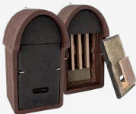
Large Multi Chamber WoodStone