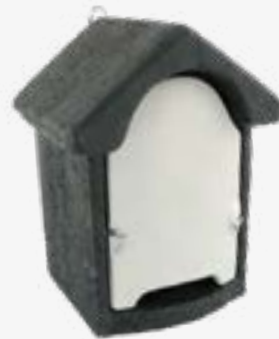
Vivara Pro WoodStone Bat Box

All bat boxes should be positioned in an open and sunny location (ideally boxes should have 6–8 hours of direct sunlight) around 3–6 metres high (the higher the better). It is important to avoid placing these close to any artificial lights such as streetlamps or security lights. Externally mounted boxes can be attached via a hanger or fixing bracket and it is best to fix them with aluminium nails.