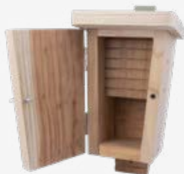
Double Chamber Bat Box

Bat boxes can be made from a number of different materials, which vary in longevity, durability and often price. The most common materials are wood (often timber); a wood and concrete blend, sometimes known as woodstone or woodcrete; eco-plastic; and concrete. Below is a brief description of each alongside one of our best sellers.