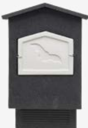
Low Profile WoodStone