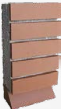
Habibat Bat Box 001