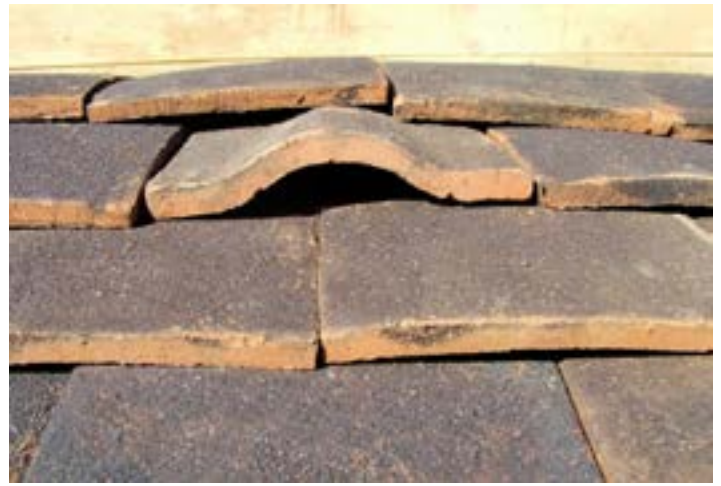
Vivara Pro Build-in WoodStone Bat Box

There are also pole-mounted bat boxes (sometimes known as rocket boxes). These bat boxes are helpful alternatives in areas where there is nowhere to mount the bat box. An additional benefit is that they ensure that the box is exposed to as much sunlight as possible in shaded areas.