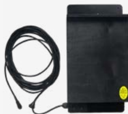
Heated Bat Roost Box