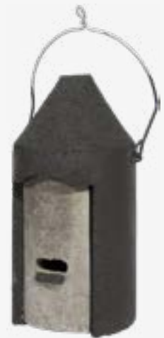
2F Schwegler Bat Box (General Purpose)