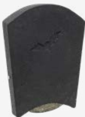
Beaumaris Woodstone Bat Box