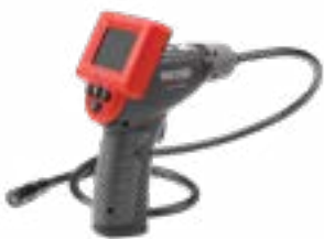
Ridgid SeeSnake Micro CA-25 Inspection Camera