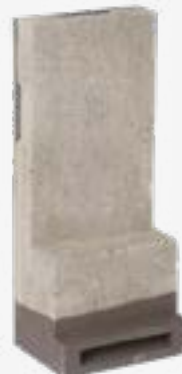
Vivara Pro Build-in WoodStone Bat Box