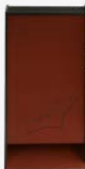
Integrated Eco Bat Box