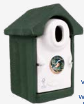
Vivara Pro Seville WoodStone Nest Box

Variety of species including Tree and House Sparrows, Nuthatches, flycatchers, as well as smaller bird species.