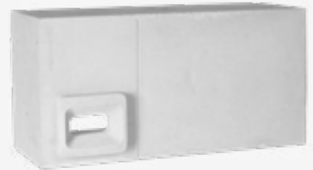
Swift Block (Large)