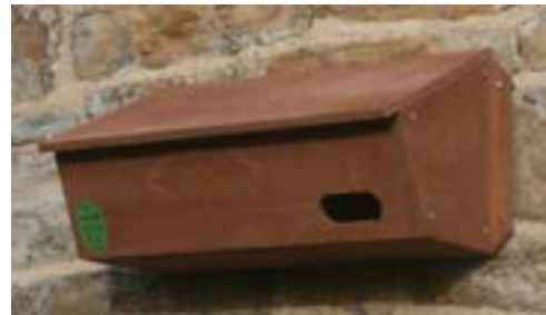
FSC Wooden Swift Box

Bird boxes that can be integrated into buildings are popular with new housing developments because they can be built flush with the wall, making them aesthetically pleasing and discrete. To add to this, some of these boxes are plain for rendering or can be custom faced with a chosen brick type. These boxes provide a safe and spacious area for birds to nest, and it is important that the entrance hole is left exposed to allow the birds easy access to the box.