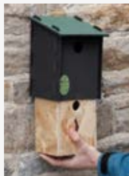
Eco Small Bird Box