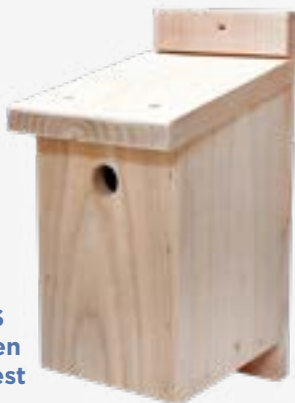
NHBS Wooden Bird Nest Box

For the smallest of species, including Blue Tits, Coal Tits and Marsh Tits.