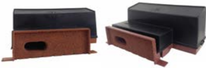
Manthorpe Swift Brick

Bird boxes that can be integrated into buildings are popular with new housing developments because they can be built flush with the wall, making them aesthetically pleasing and discrete. To add to this, some of these boxes are plain for rendering or can be custom faced with a chosen brick type. These boxes provide a safe and spacious area for birds to nest, and it is important that the entrance hole is left exposed to allow the birds easy access to the box.