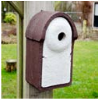
Vivara Pro WoodStone Starling Nest Box