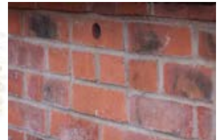
Starling Box - Smooth Brick