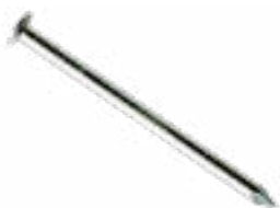
Heavy Duty Aluminium Nails