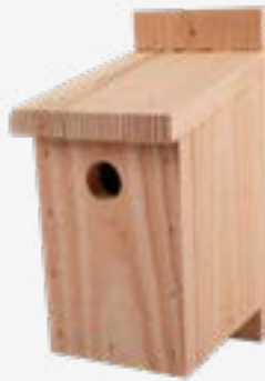
NHBS Wooden Bird Nest Box