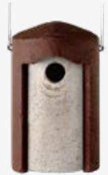
1B Schwegler Nest Box