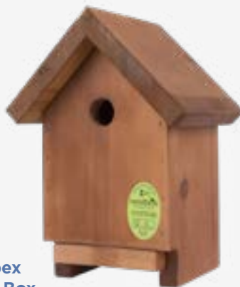
Apex Bird Box

Smallest of bird species, plus slightly larger species such as Great Tits and Tree Sparrows.