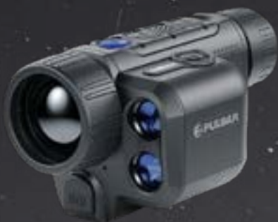
Pulsar Axion 2 LRF XQ35 Pro Thermal Imaging Monocular