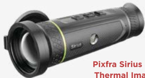
Pixfra Sirius S650 Thermal Imaging Monocular