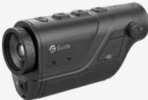
Guide TD210 Thermal Imaging Monocular

Some thermal imaging devices have low specifications and for this reason they are not suitable for professional wildlife surveys. These devices tend to be more affordable and are suitable for general wildlife watching.