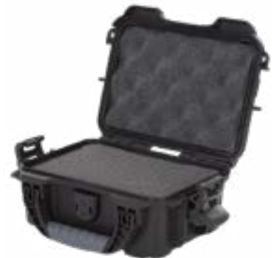
Nanuk Protective Hard Case