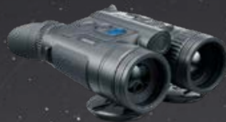
Pulsar Merger LRF XP35 Thermal Imaging Binoculars