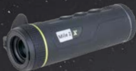
Pixfra Mile 2 M400 Series Thermal Imaging Monoculars