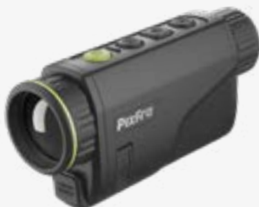
Pixfra Arc 613 Thermal Imaging Monoculars