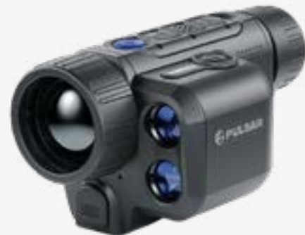
Pulsar Axion 2 LRF XQ35 Pro Thermal Imaging Monocular

Advanced devices: Due to their high specifications, advanced devices produce more accurate detail and higher quality images. This makes them suitable for use as a survey aid for professional and ecological wildlife surveys.