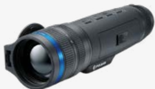
Pulsar Telos XP50 Thermal Imaging Monocular