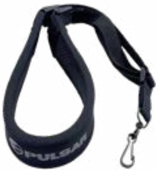
Pulsar Neck Strap